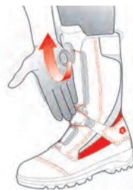
4. Use the edge of your hand to turn the push-and-turn button closed until the boot fits perfectly!