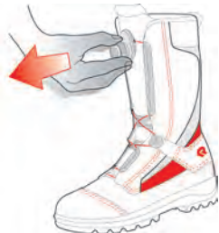
1. Pull the push-and-turn button!

Fast, optimum adaptation of the boot to the foot is made possible by the innovative BOA® lacing system. (BOA® is a registered brand name of BOA® Technology Inc.)