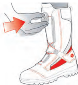
3. Push the push-and-turn button!