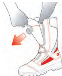
2. Pull the leather tongue forwards and put the boot on!