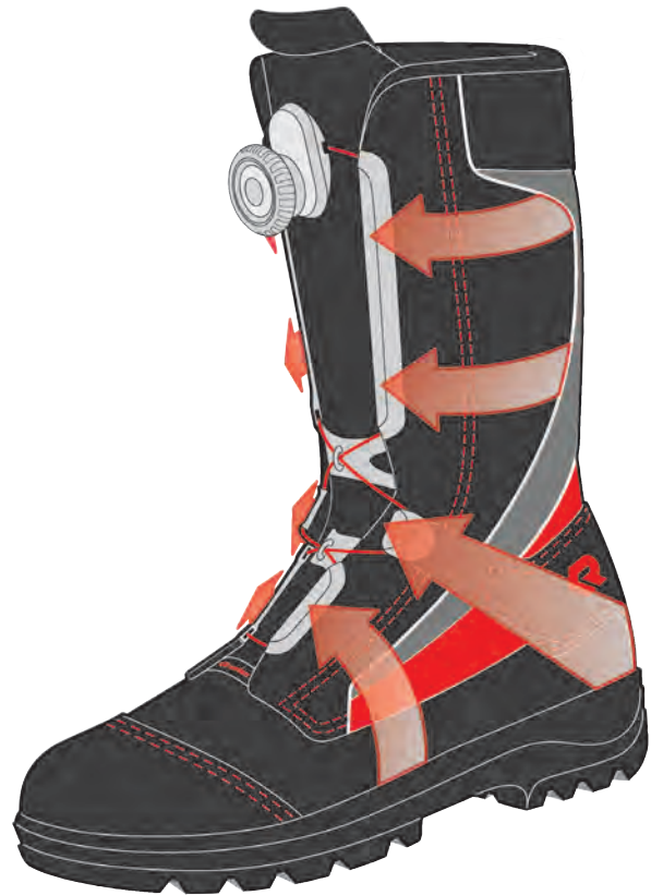
Turning the push-and-turn button tightens the laces uniformly over the entire front area of the boot.